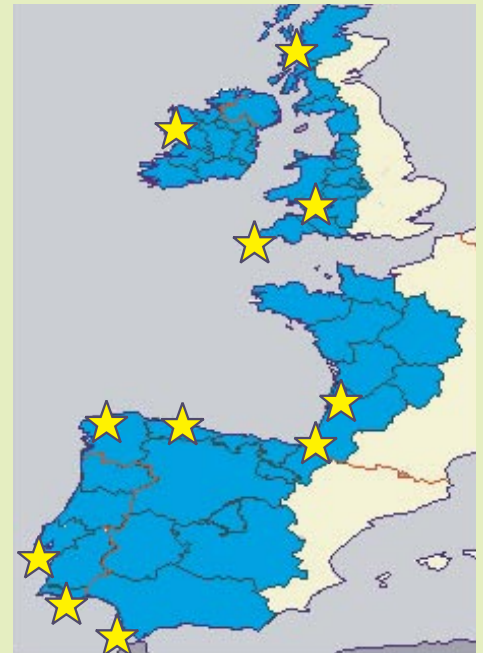
The Atlantic Arc and project partner areas