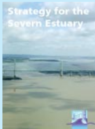
The Strategy for the Severn Estuary (2001)

Tel: 029 20 874713 Email: severn@cardiff.ac.uk www.severnestuarypartnership.org.uk