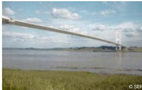
The First Severn Crossing

The management scheme is concerned with promoting the sustainable use of a living, working Estuary. There is no intention to stop people using the estuary, unless the activity they are involved in is damaging the specific features for which the Estuary is designated.